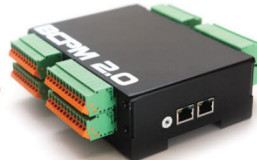
EnerSure® BCPM2.0 (42 Circuit Shown)

Daisy chain multiple BCPM2.0s up to 120 circuits